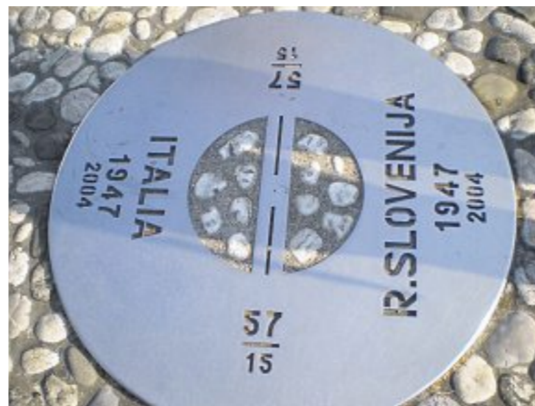
At the border

We meet with a number of producers from the eastern part of the valley and taste at Faladur, a bright and airy tast-